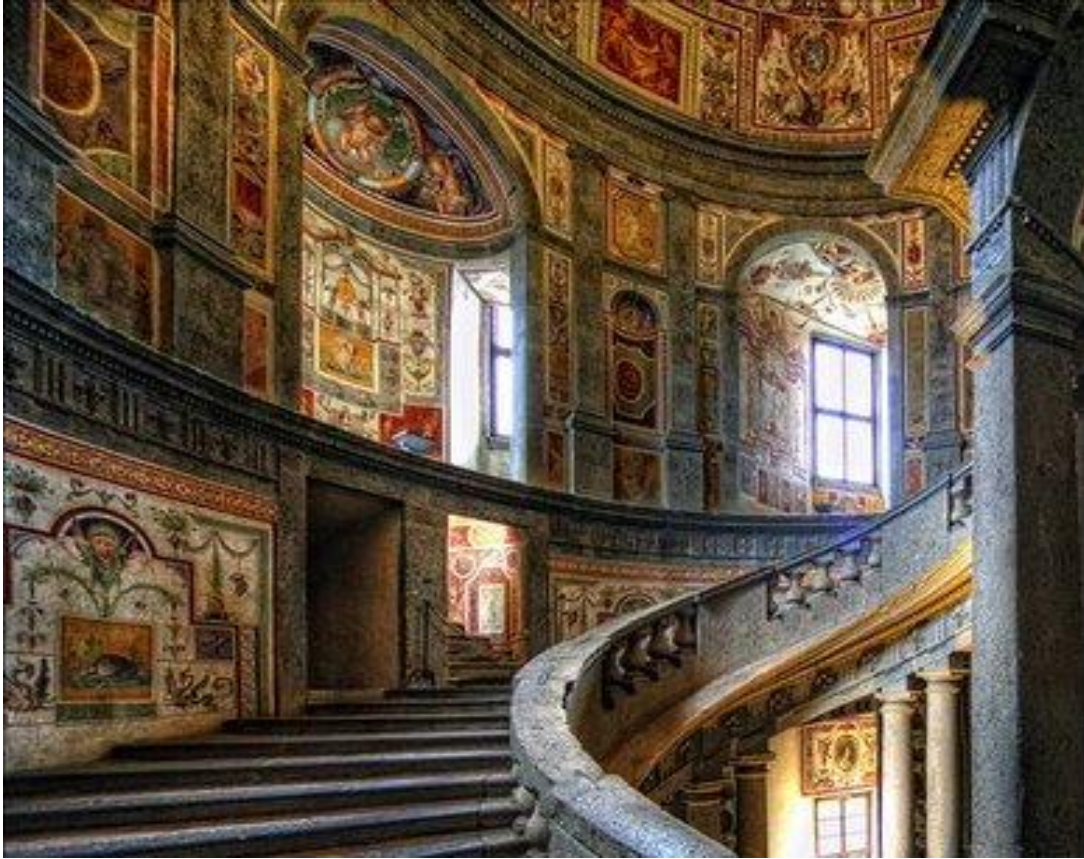
Scala Elicoidale - Palazzo Farnese, Caprarola (Viterbo)