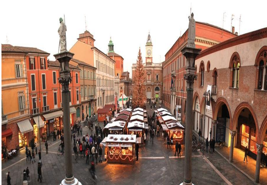
Piazza del Popolo - Ravenna

9:00 - 09:45 Opening Ceremony ( Aula Magna )