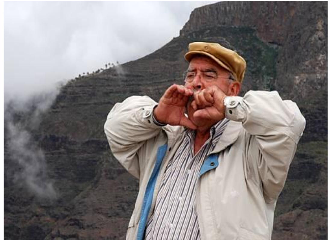
El Silbo Gomero