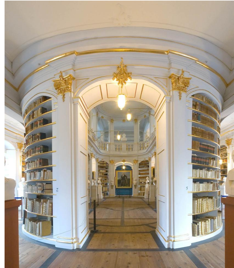
Duchess Anna Amalia Library- Weimar